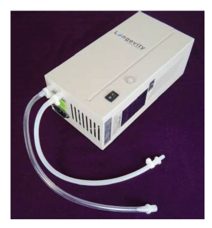
Fig. 1 Longevity resources EXT50 ozone generator.